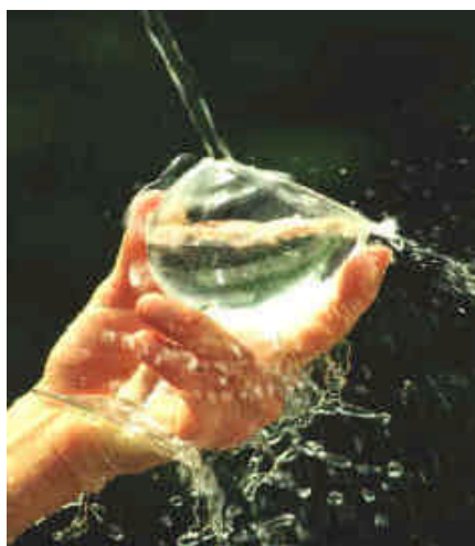
WATER, Source of life

Unless of course (the thought came to mind), those responsible in these other islands, or at least some of them, had had better foresight regarding the water problem.